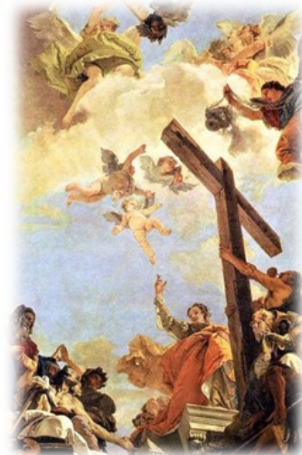
The Exaltation of the Holy Cross