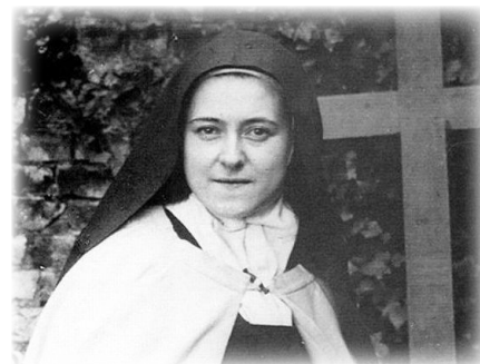
St. Thérèse, Pray for Us!