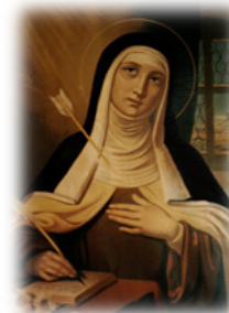
St. Teresa of Avila, Pray for Us!