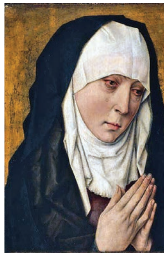
Mater Dolorosa, 1470-75, Dieric Bouts