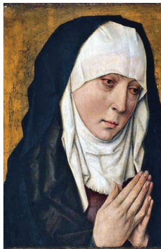
Mater Dolorosa, 1470-75, Dieric Bouts