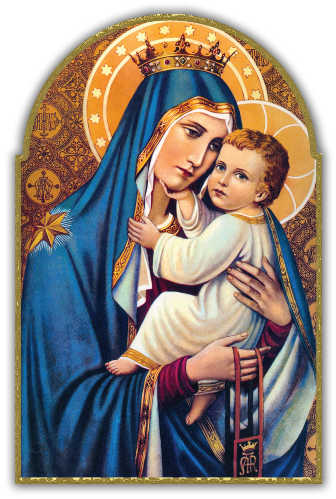
OUR LADY OF MT. CARMEL

SERVED BY THE ORATORY OF SAINT PHILIP NERI