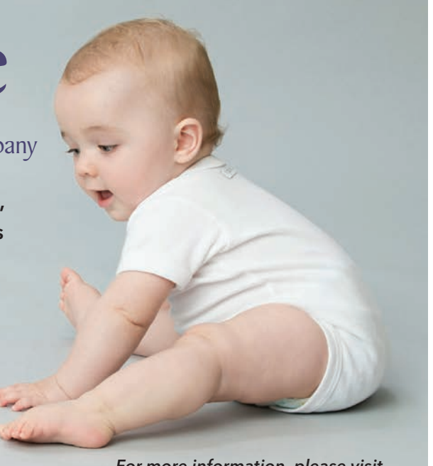
For more information, please visit MariaForLife.org/everylife.

Visit us at the Maria for Life table after Mass on May 12 (May Crowning) to receive a complimentary package of EveryLife diapers and learn how you can support OSM Pregnancy Care Center when your family switches to EveryLife diapers.